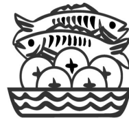
Loaves & Fishes

Loaves & Fishes, a non-profit group utilizing volunteers from local churches and local community members, provides a free meal to anyone in the community on the 4th Sunday of each month from 4:00—6:00 PM. Please join us on Sunday, June 22, 2014 at 4:00 PM for a wonderful meal served in our Fellowship Hall downstairs. Volunteers are needed each month to help cook, serve, welcome, and clean up. If you would like to help, please contact Donna Phillips at 325-3738.